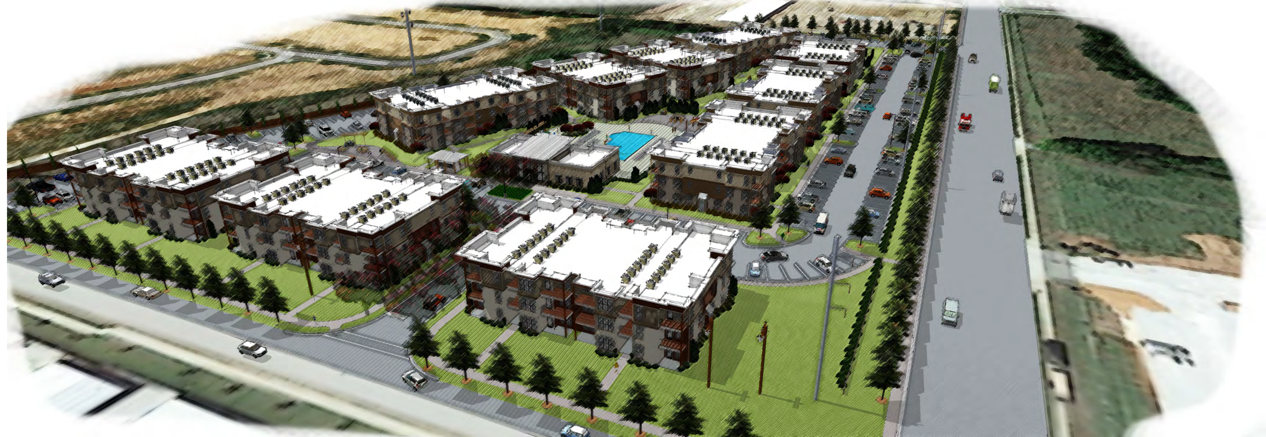
1. BIRDS EYE FROM CENTERTON BLVD AND WOMACK ROAD