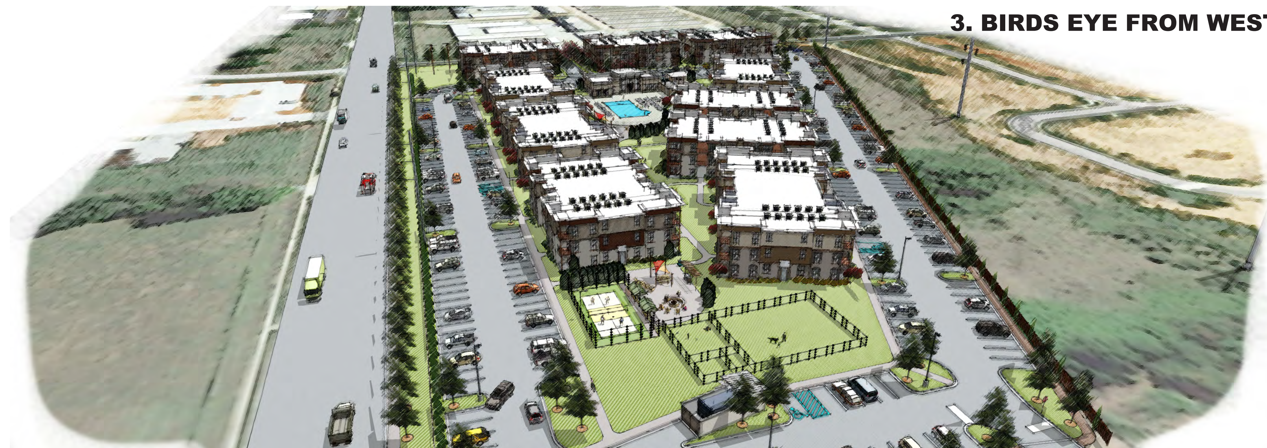
3. BIRDS EYE FROM WEST

SUBJECT TO REGULATORY AGENCY REVIEW AND APPROVAL