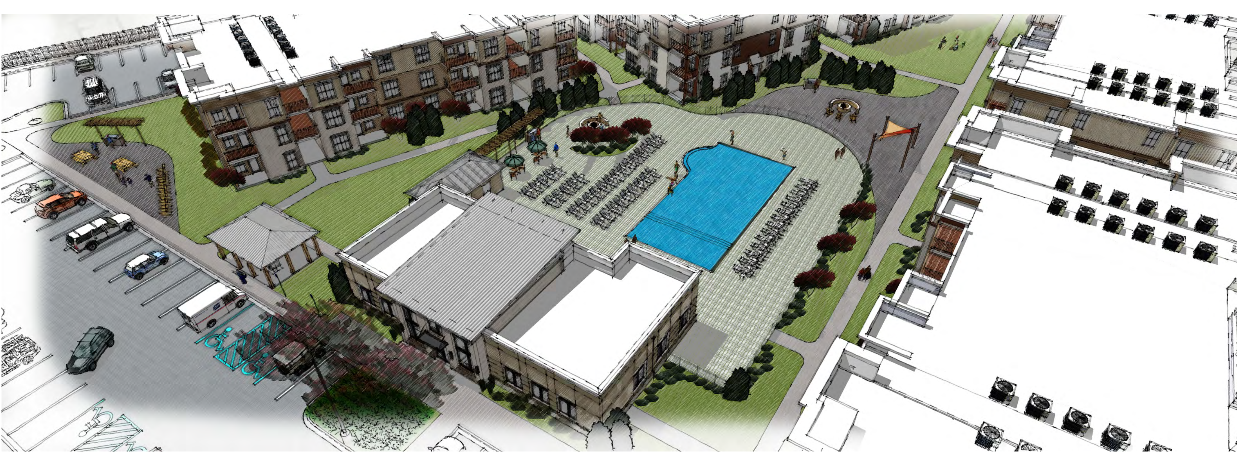
6. AMENITY CENTER / CLUBHOUSE