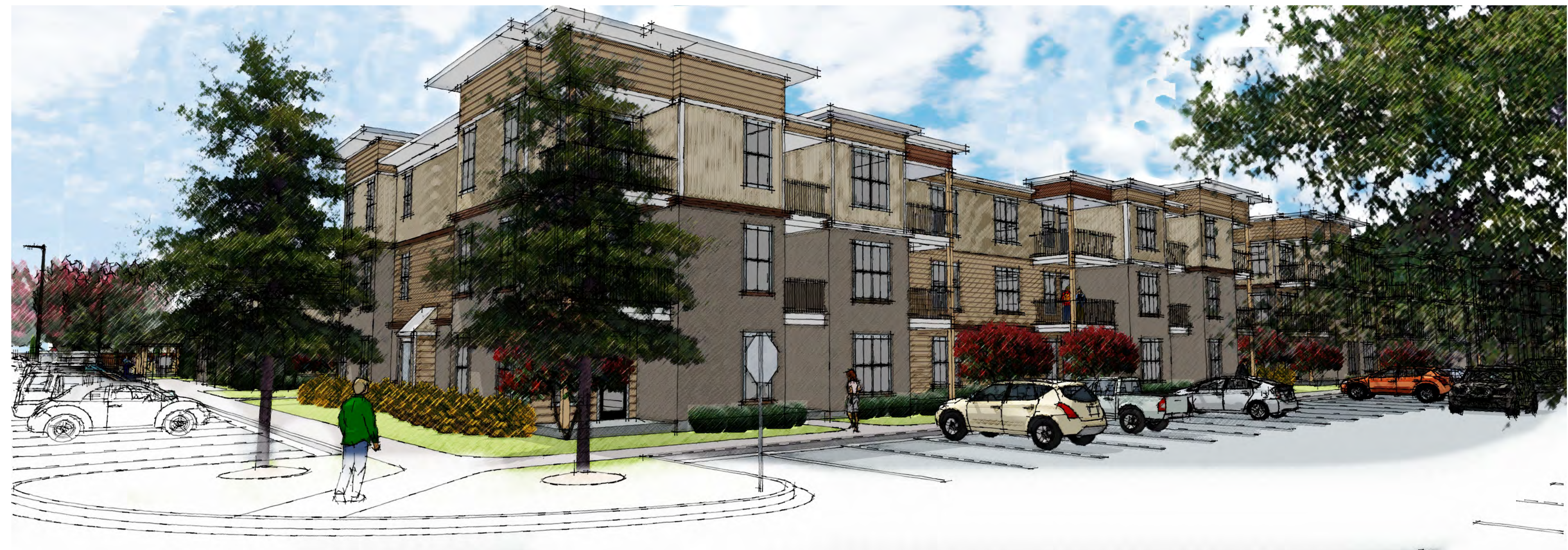
5. BUILDING TYPE 2