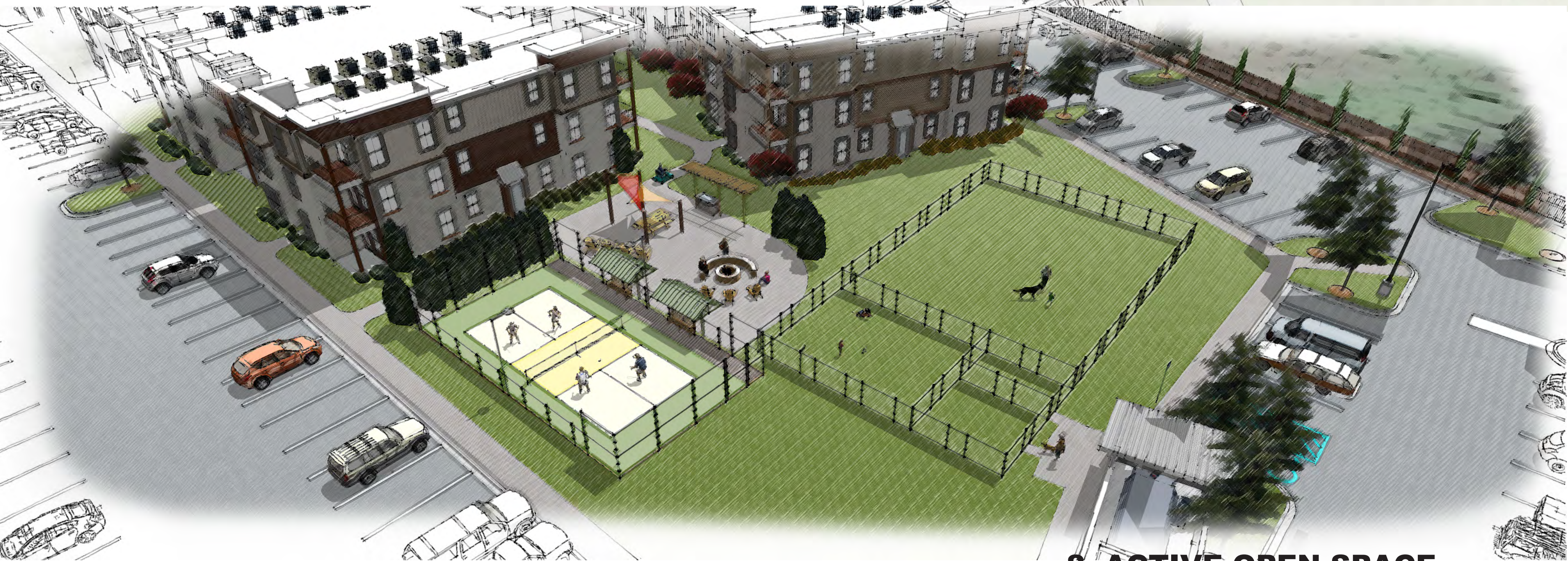
8. ACTIVE OPEN SPACE

SUBJECT TO REGULATORY AGENCY REVIEW AND APPROVAL