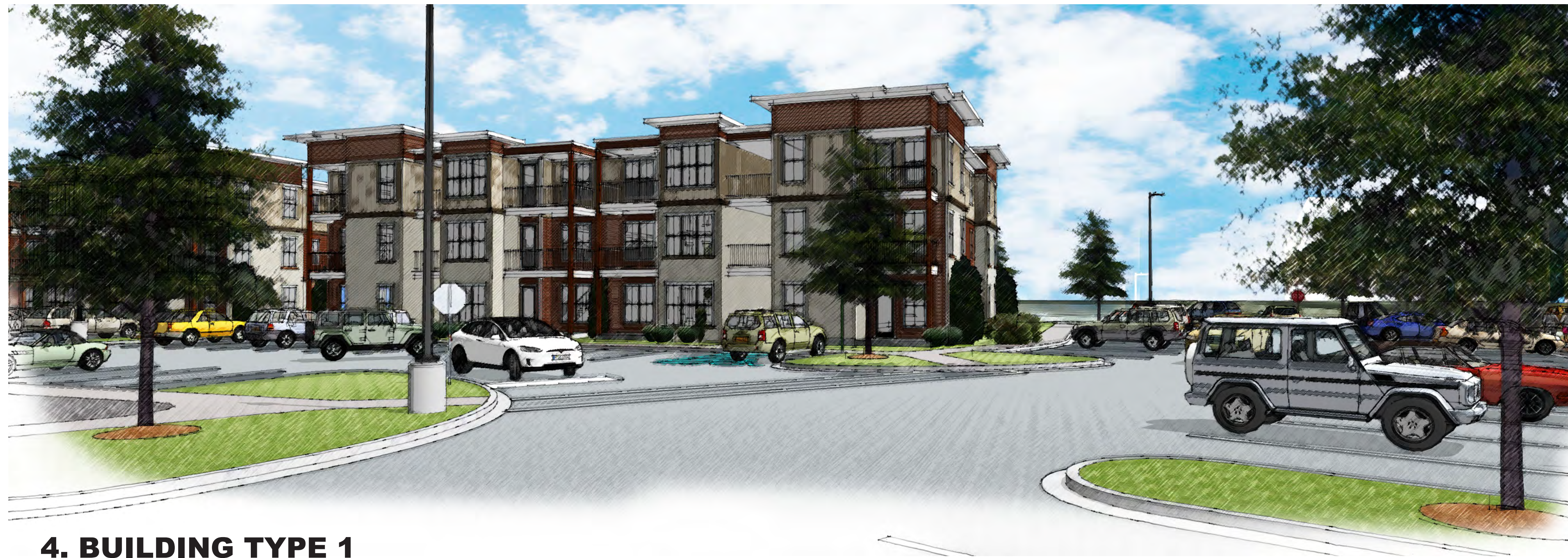
4. BUILDING TYPE 1