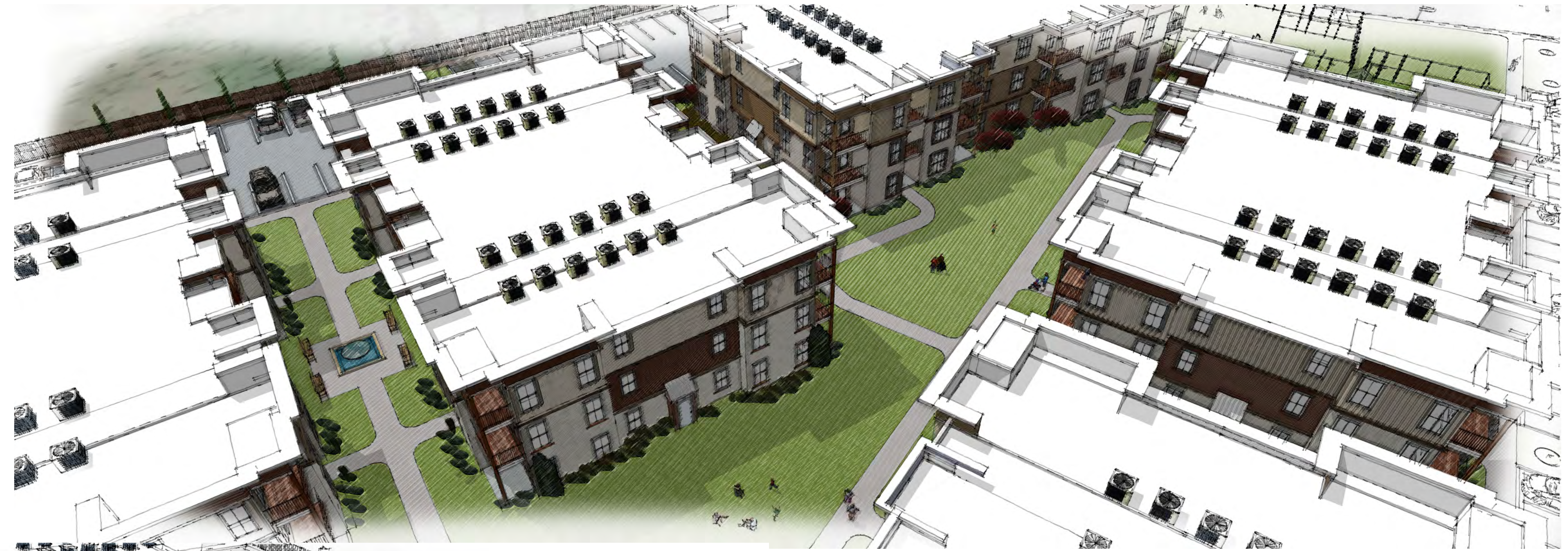
7. OPEN SPACE / COURTYARD